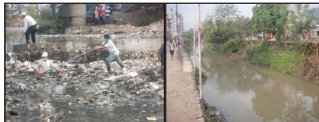
Before a previous HOMES Nepal clean-up

THE FUTURE: After this project we will move on to water treatment making the river clean and safe for use. We have completed a basic survey and will be undertaking a comprehensive survey of the area to inform water treatment planning.